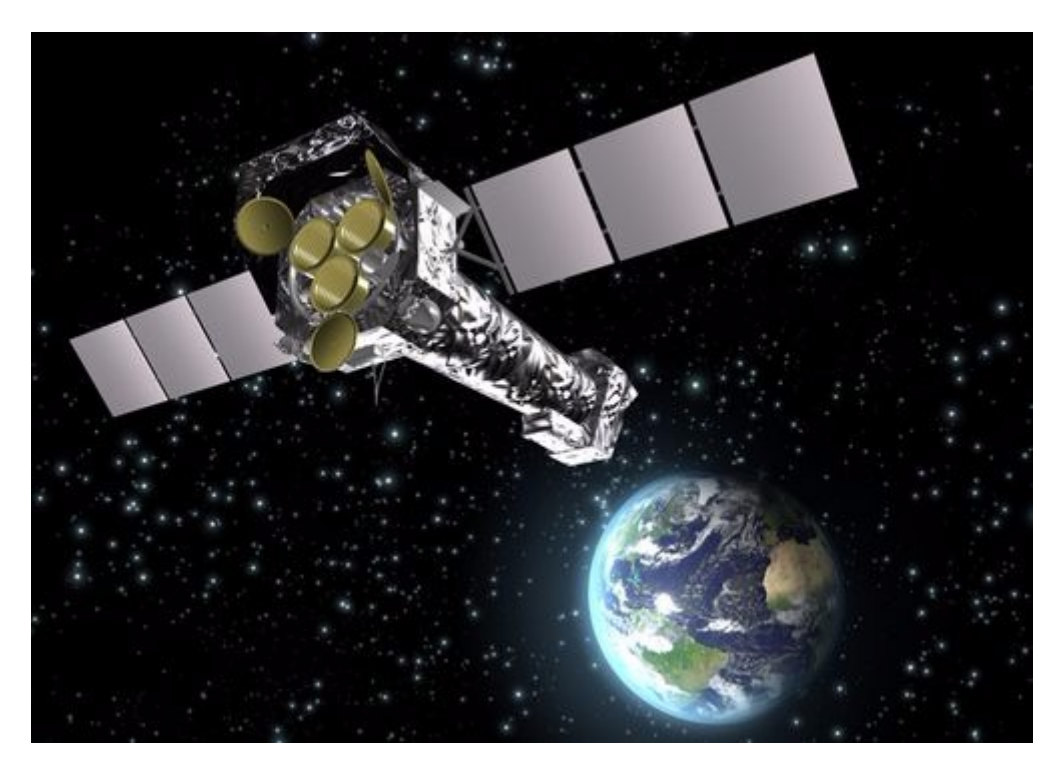
Image courtesy of D. Ducros and the European Space Agency (ESA) Artist's idea of XMM Newton Space Telescope