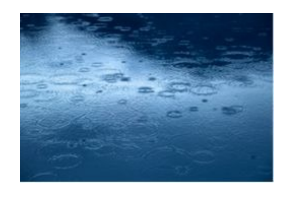
tiny drops of water