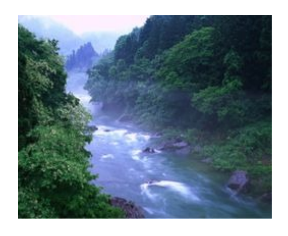
in a river